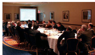
Administrative Council members of WFUMB and AIUM met during the annual AIUM congress to exchange ideas, initiatives, and actions mainly in the field of education and safety of medical ultrasound.

As such a most fruitful meeting took place during the latest AIUM Annual Congress in New York where the Administrative Council members of WFUMB and AIUM met and discussed common ideas, initiatives and actions mainly in the field of education and safety.