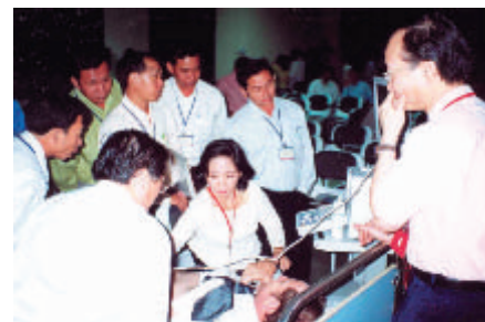
The "Training the Trainers" course in Dhaka, Bangladesh, included hands-on training.

Thirty-seven medical doctors with more than